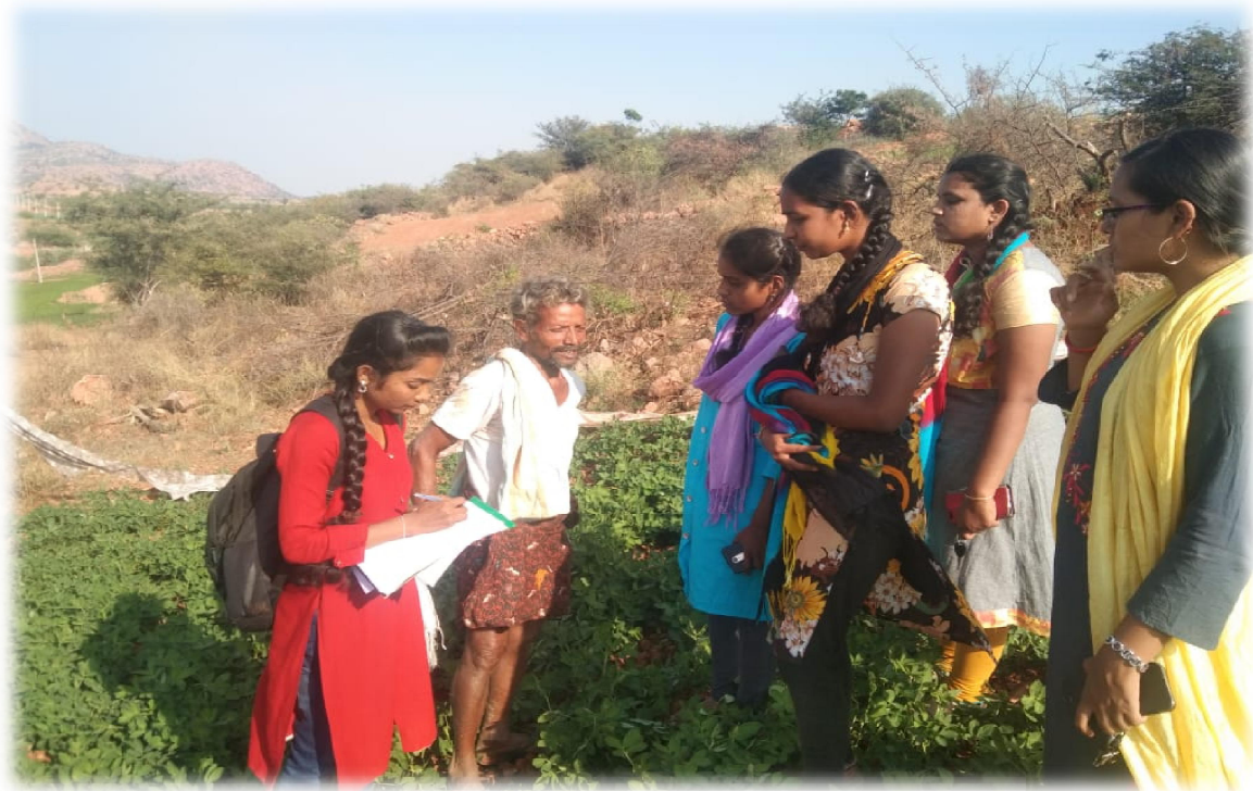
Project Work (Terrace farming) related Field visit at Venatampalli fields (III year MBBC Students)