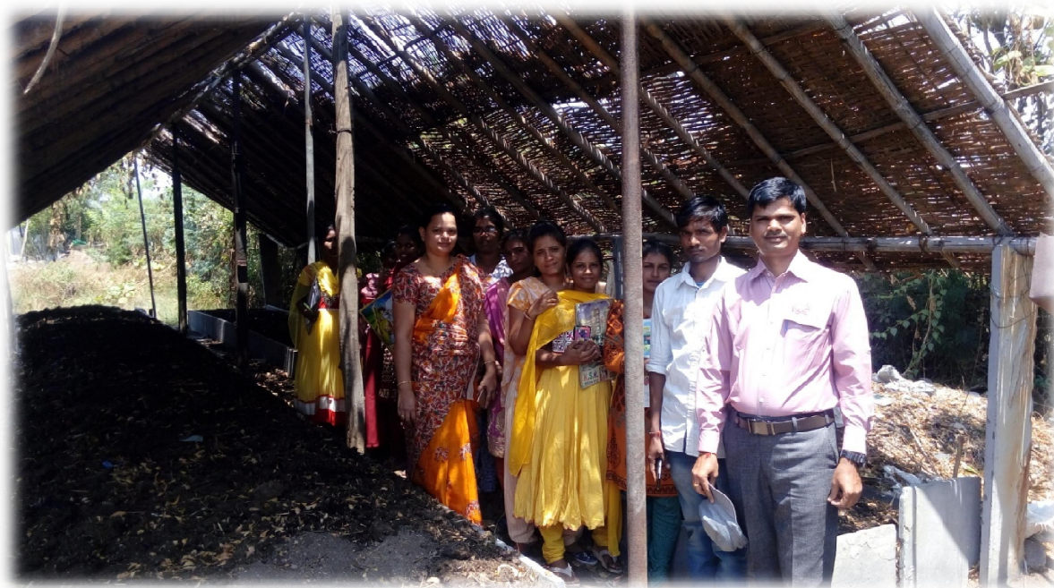
Field visit at “Vermi compost Unit- Kamma Kottala” (Staff, III-Year BZC & MBBC Students)