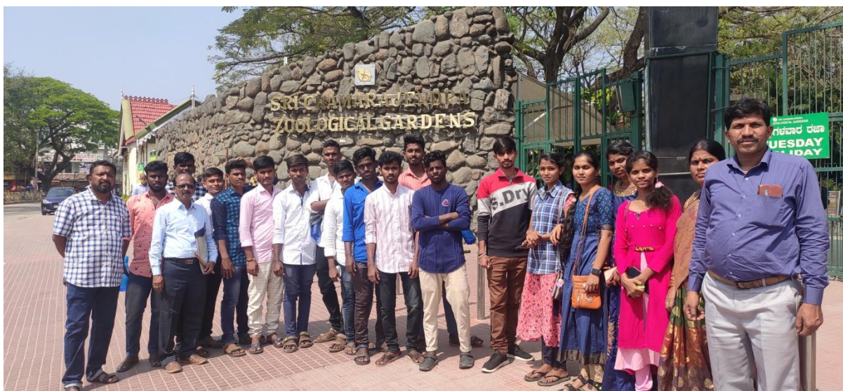
Botanical Tour team at Zoological Gaden,Mysore(Staff & III year BZC& MBBC Students)