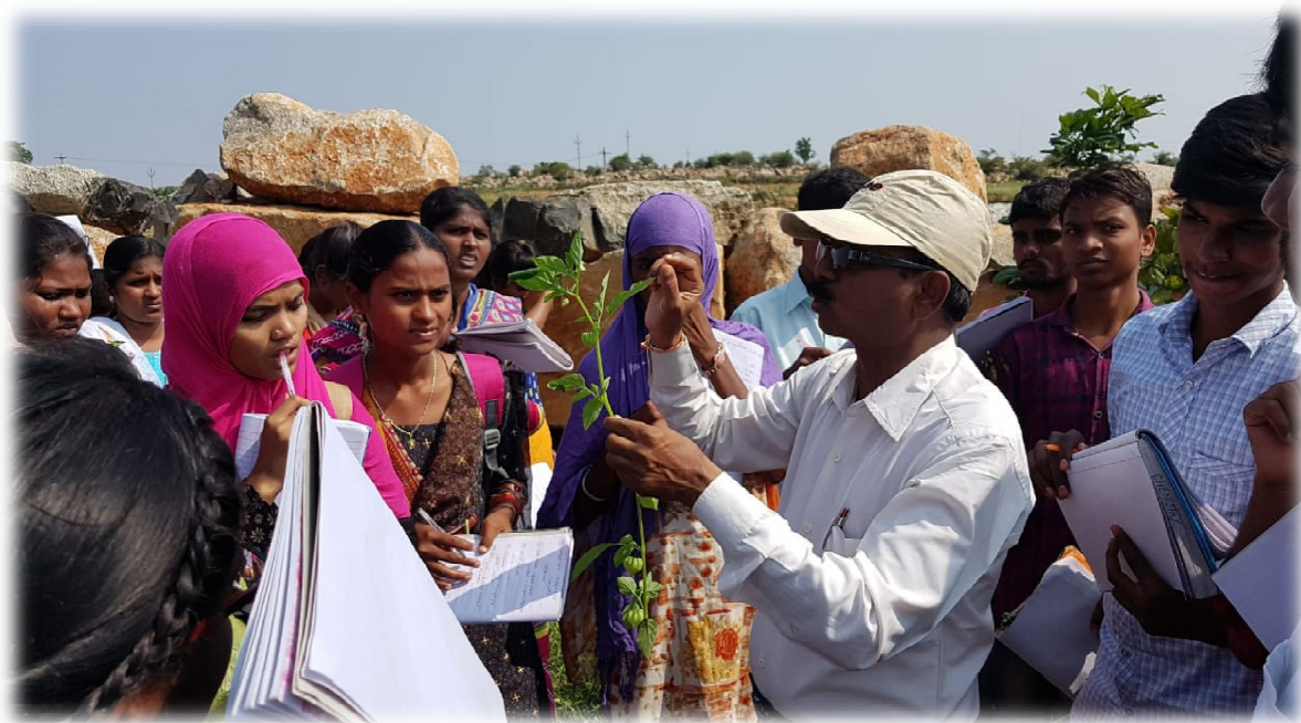
Field visit at Buggasangala Forest (Staff, BZC & MBBC Students)