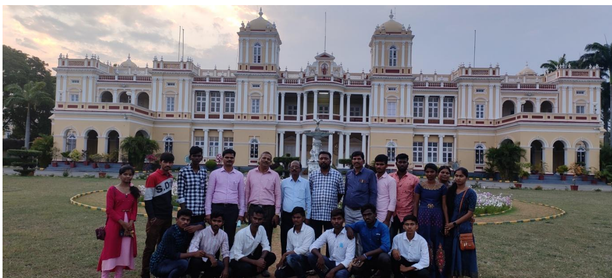
Botanical Tour team at CFTRI, Mysore & Lalbagh Botanical Garden, Bangalore