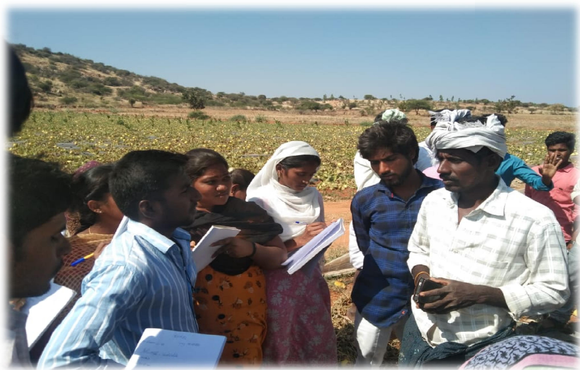
Project Work (Organic farming) related Field visit at Palyam village fields (III year BZC Students)