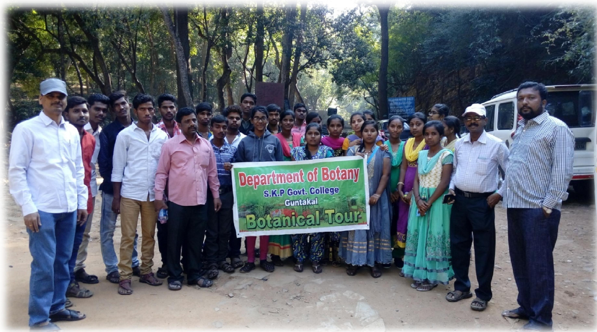
Botanical Tour team (Staff, III-Year BZC & MBBC Students) at “Thalakona forest & Water falls”.