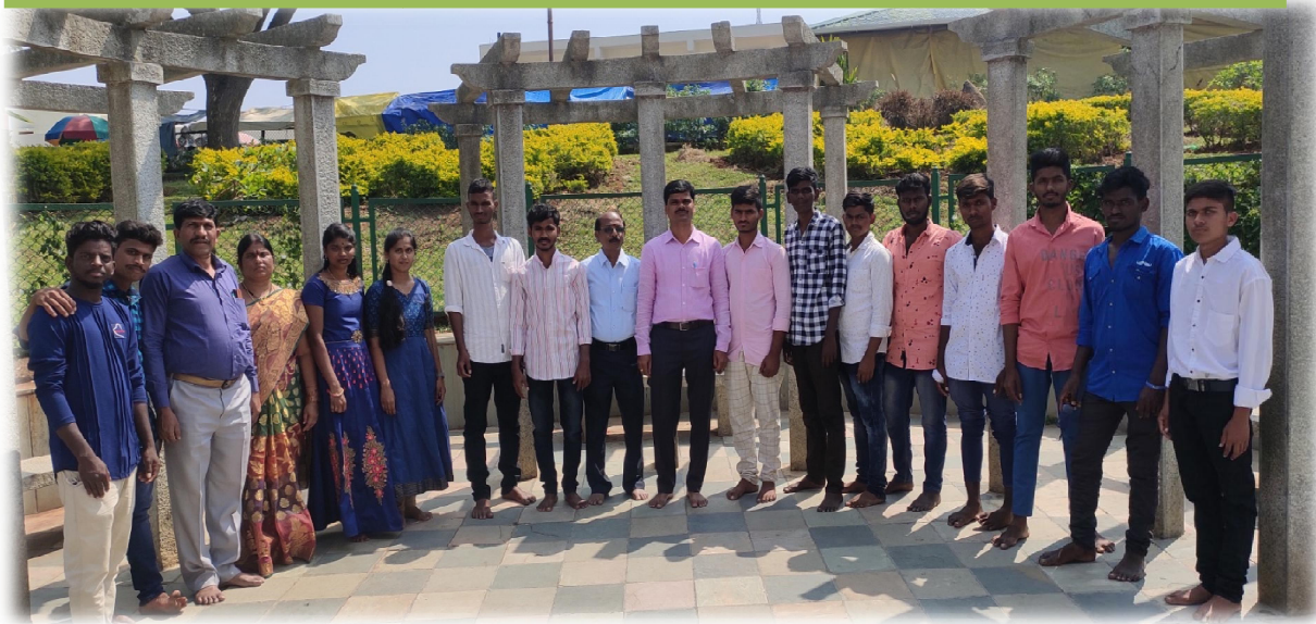
Botanical Tour team at Chamundeswary Hills & Srirangapatnam, Mysore (Staff & III year BZC & MBBC)