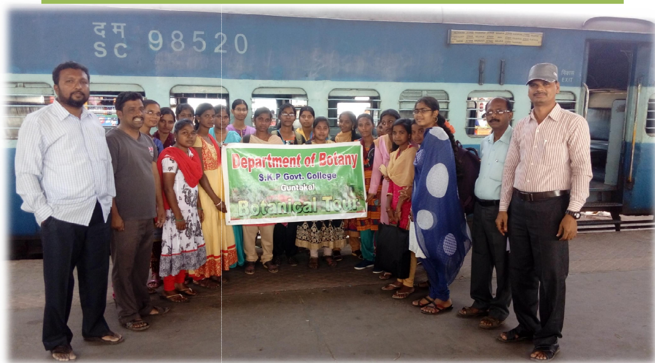
Commencement of Botanical Tour from Guntakal Railway station. Staff, III-Year BZC & MBBC Students